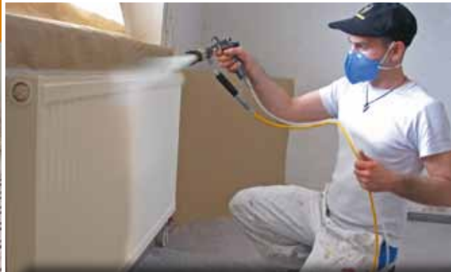
Pneumatic piston pump