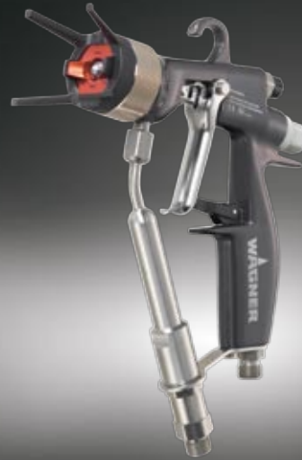
Light gun GM 4600AC