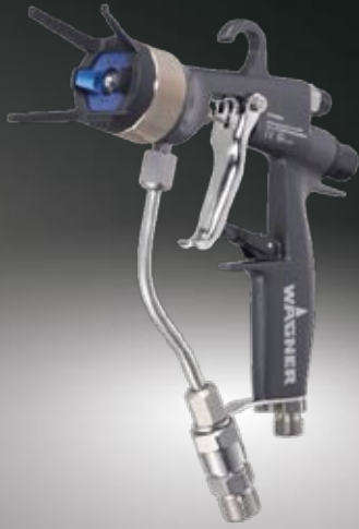
Ultra light gun GM 4100AC