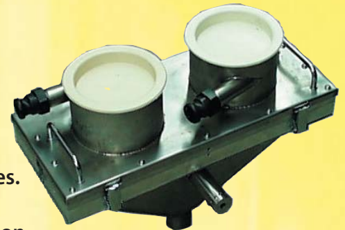
Ultrasonic sieve as a suspended version

They have been specially developed for these requirements and will convince due to their compact dimensions, high sieving performance, fast and simple cleaning and thus short colour change times.